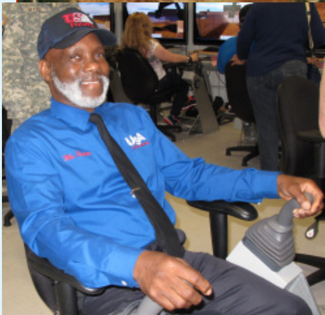
<--Our Bus Driver also enjoyed the day