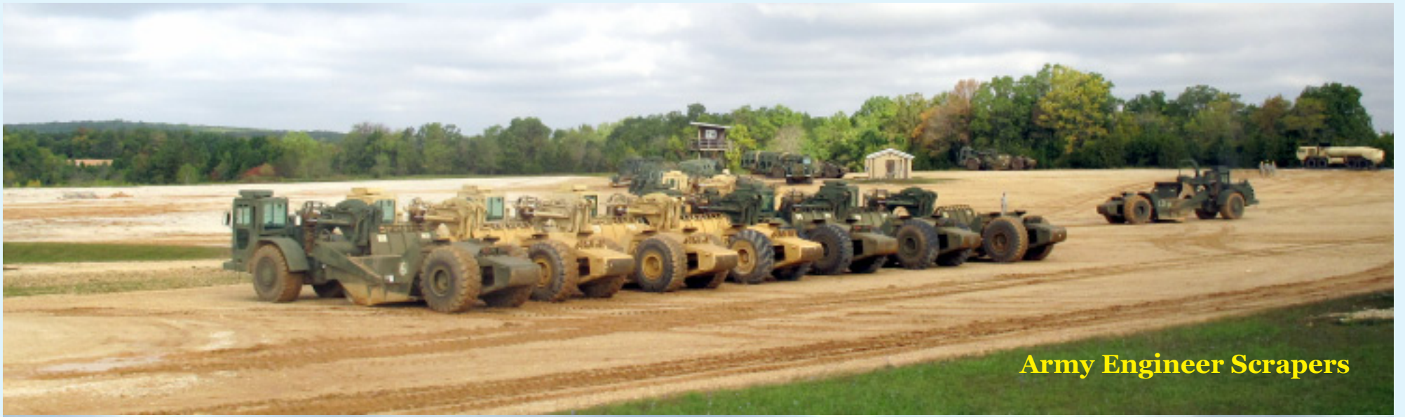
Army Engineer Scrapers