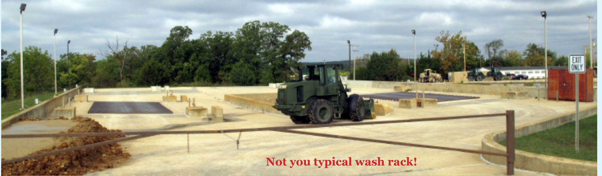
Not you typical wash rack!

Our bus drove around this multi-service training area called Normandy Training Area 244