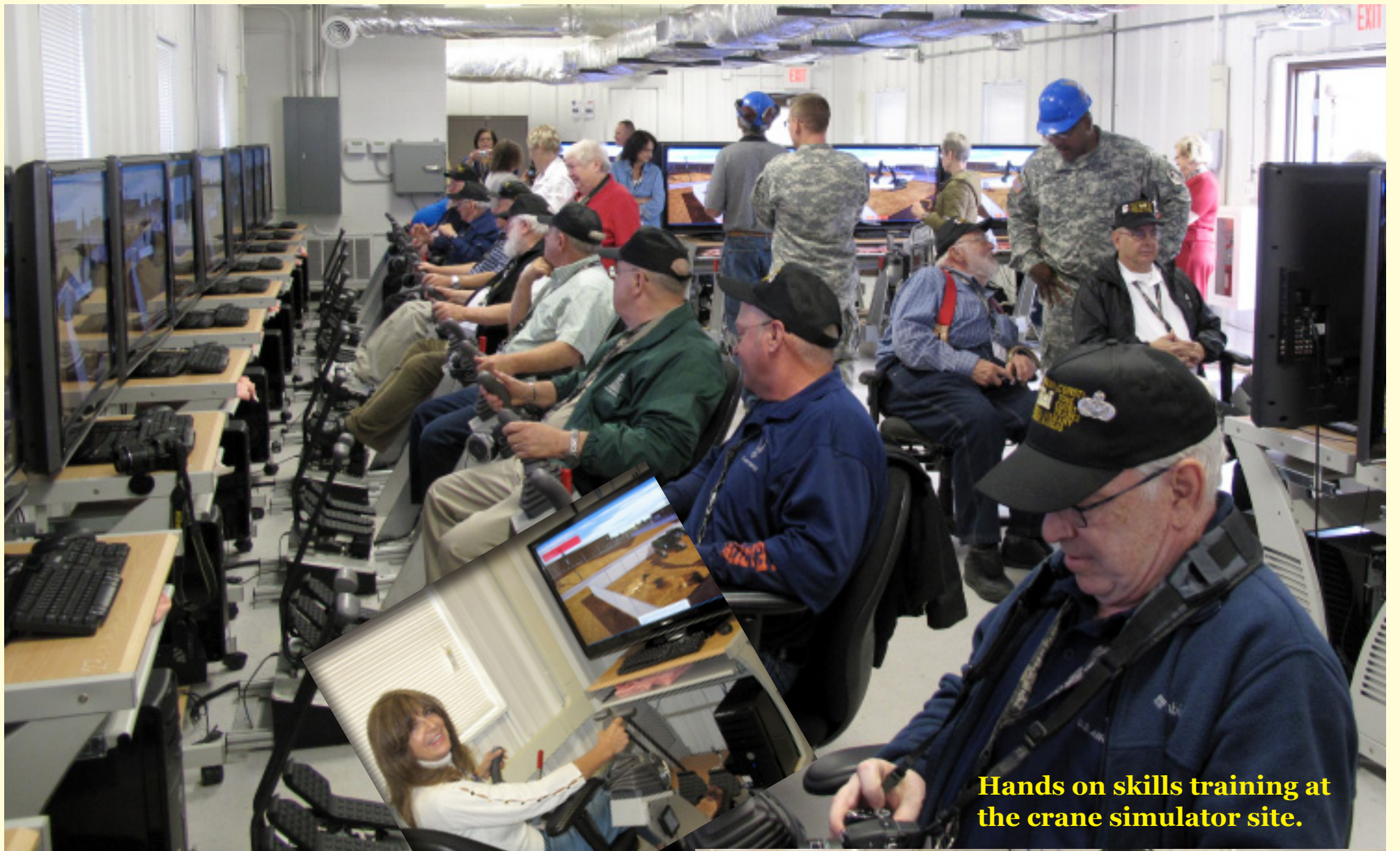
Hands on skills training at the crane simulator site.