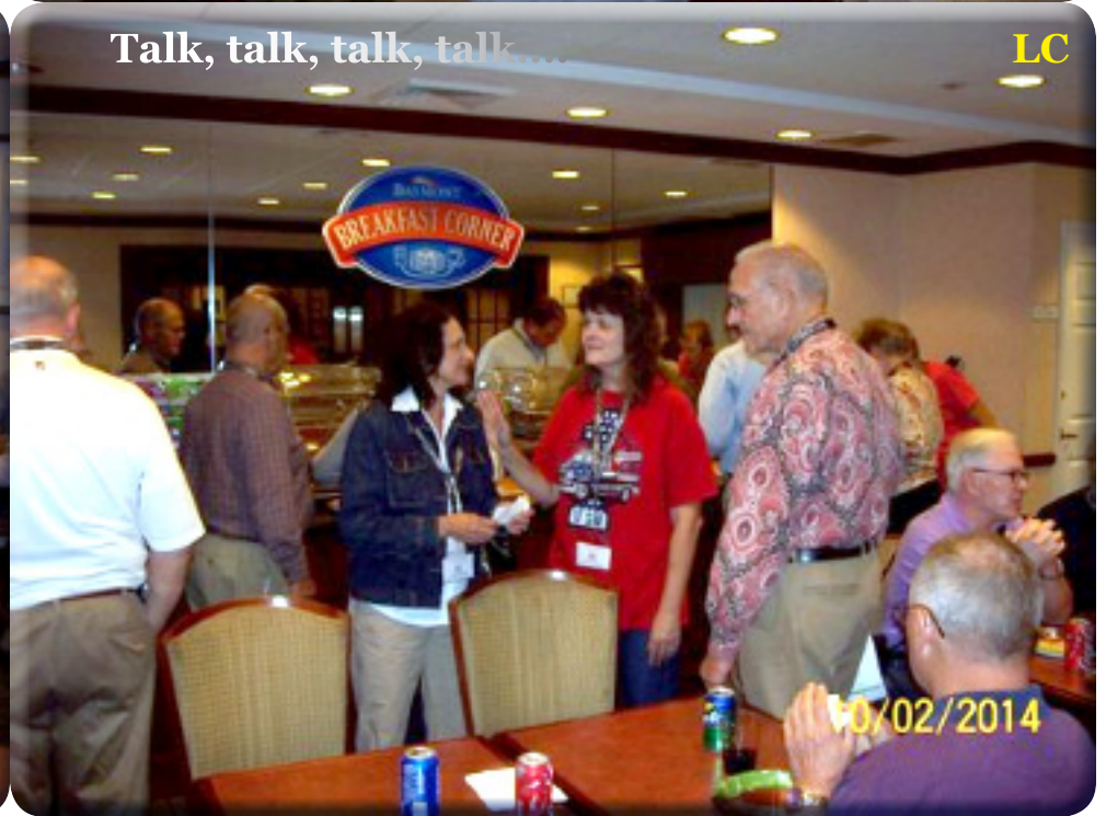
Talk, talk, talk, talk...