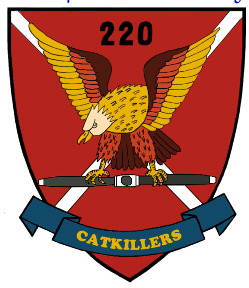
Vets With a Mission, <a href="http://www.vetswithamission.org">http://www.vetswithamission.org</a> - Chuck Ward