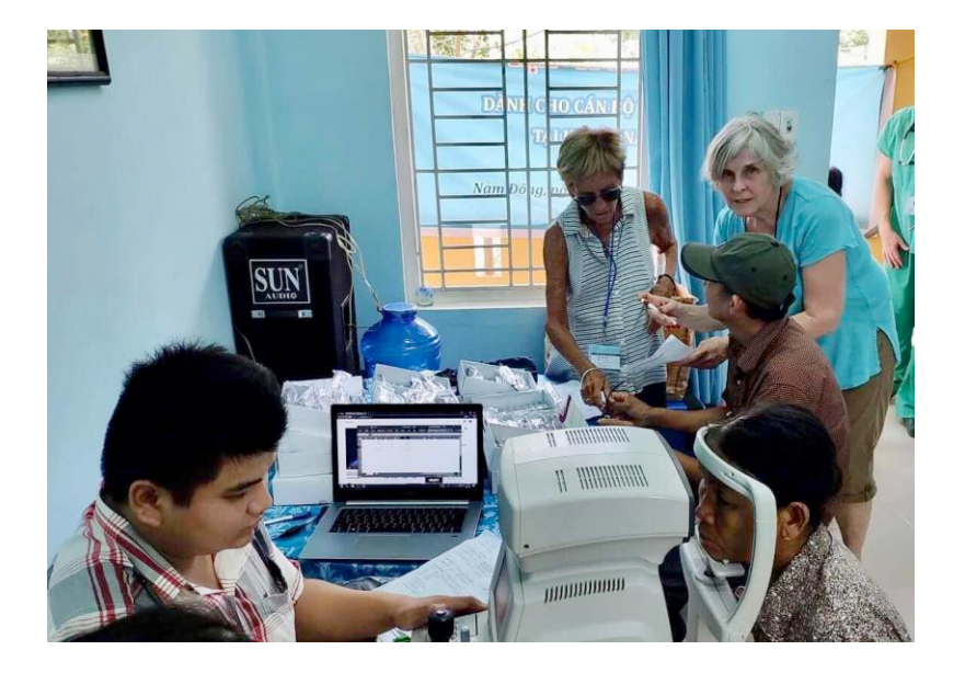
including (above) ophthalmology record keeping and data entry; in triage, lab,