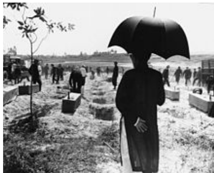
Burial of 300 unidentified victims

On the same day, the Liberation Front radio announced, "We tell our compatriots that we are determined to topple the regime of the traitorous Thiệu-Kỳ clique and to punish and annihilate those who have been massacring and oppressing our compatriots...we ask our compatriots to...help us arrest all the U.S.-puppet cruel henchmen. A March 6 document written by a VC sapper unit commander recounted that his unit "participated in the killing of tyrants and the digging of trenches" A March 13, 1968 entry in captured documents reviewed the successes of the attack on Hue. "Enormous victory: We annihilated more than 3,000 tyrannical puppet army and government administrative personnel, including the Deputy Province Chief of Thua Thien." A report written by the commander of the 6th Regiment on March 30 stated that they had captured thousands of "local administrative personnel, puppet troops, and cruel tyrants" and successfully "annihilated members of various reactionary political parties, henchmen, and wicked tyrants." It also stated that they had "killed 1,000 local administrative personnel, spies and cruel tyrants."