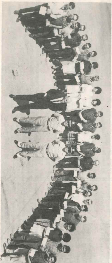
A HEALTHY MARGIN - Twenty-six French employees of the U.S. Army General Depot Complex, Ingrandes, Transportation Division surround their bosses after receiving letters of appreciation for having compiled a record of 997 total months without time

HAROLD K. JOHNSON General, US Army Chief of Staff