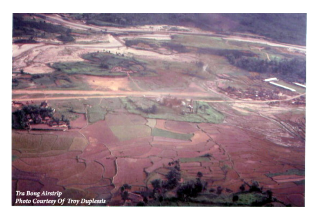
Note 2: USMC Narrative: