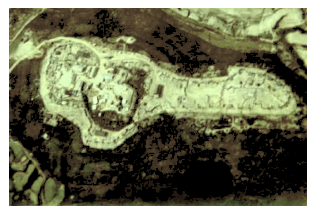
TRA BONG SPECIAL FORCES CAMP