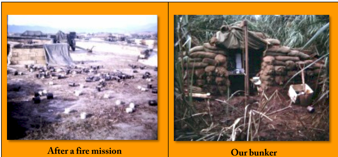
After a fire mission

mission was to secure the area so that the Sea Bees could update the airstrip and also support the Army Special Forces Camp at Long Vei. The monsoon season began immediately after we arrived, and we received 16 inches of rain in the first 24 hours. Our battery guns started sinking in the mud, resulting in the Sea Bees repositioning our guns with Caterpillars and set them up on runway matting. Khe Sanh had the largest battery in Vietnam, which consisted of 6 each, 105 towed howitzers, two 155 towed howitzers and two 4.2 mortars. Since we were located in such a remote area our CO requested the additional guns to cover closer as well as longer range targets.