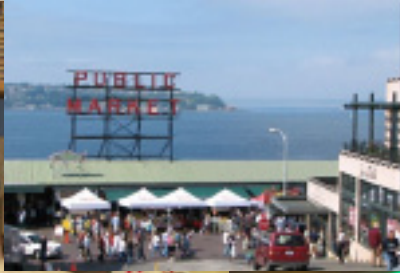
Pike Place Market Area