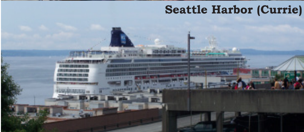
Seattle Harbor (Currie)