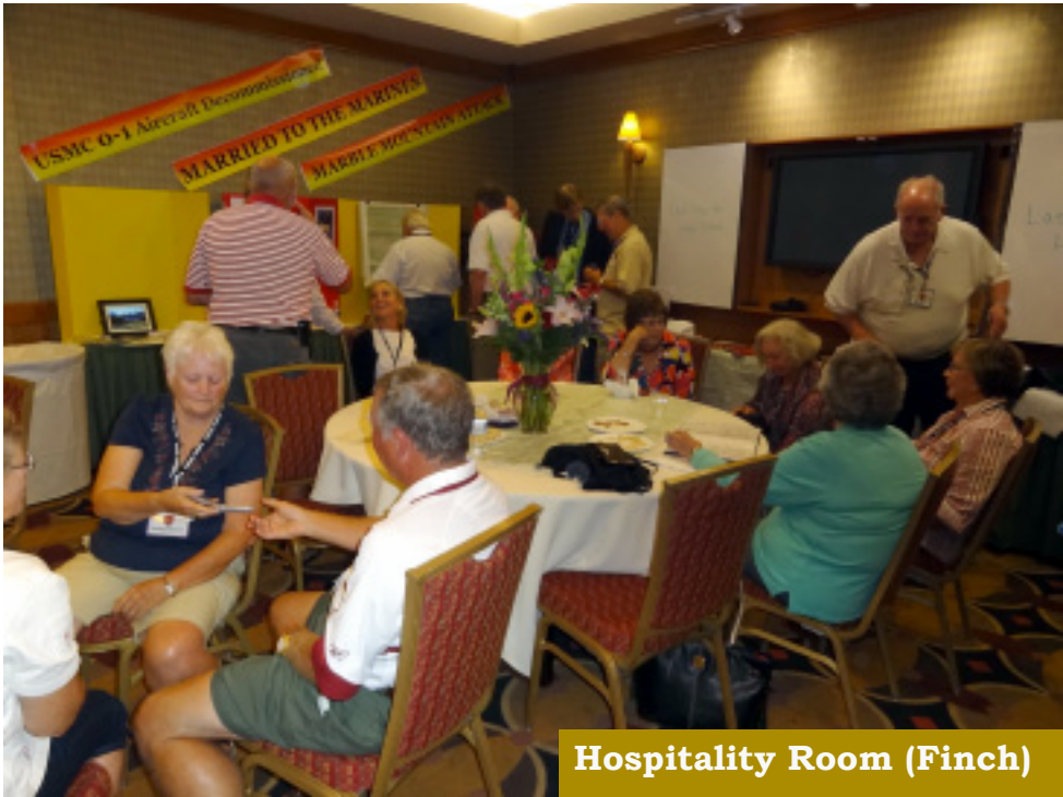
Hospitality Room (Finch)